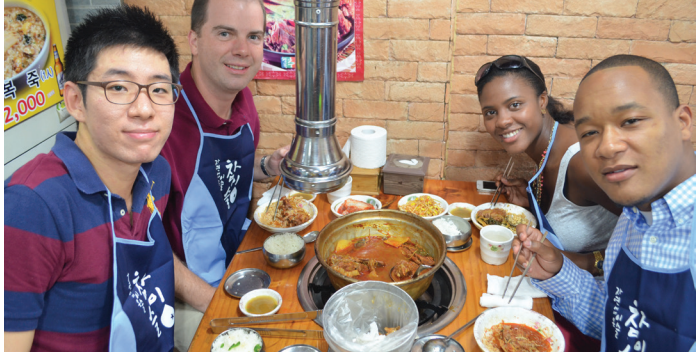
Above: Incoming MBA students start the year developing teamwork with the challenge course at the FSU Reservation. Below: Each spring and summer, the College of Business offers a Global Business Seminar, which culminates with a trip abroad.