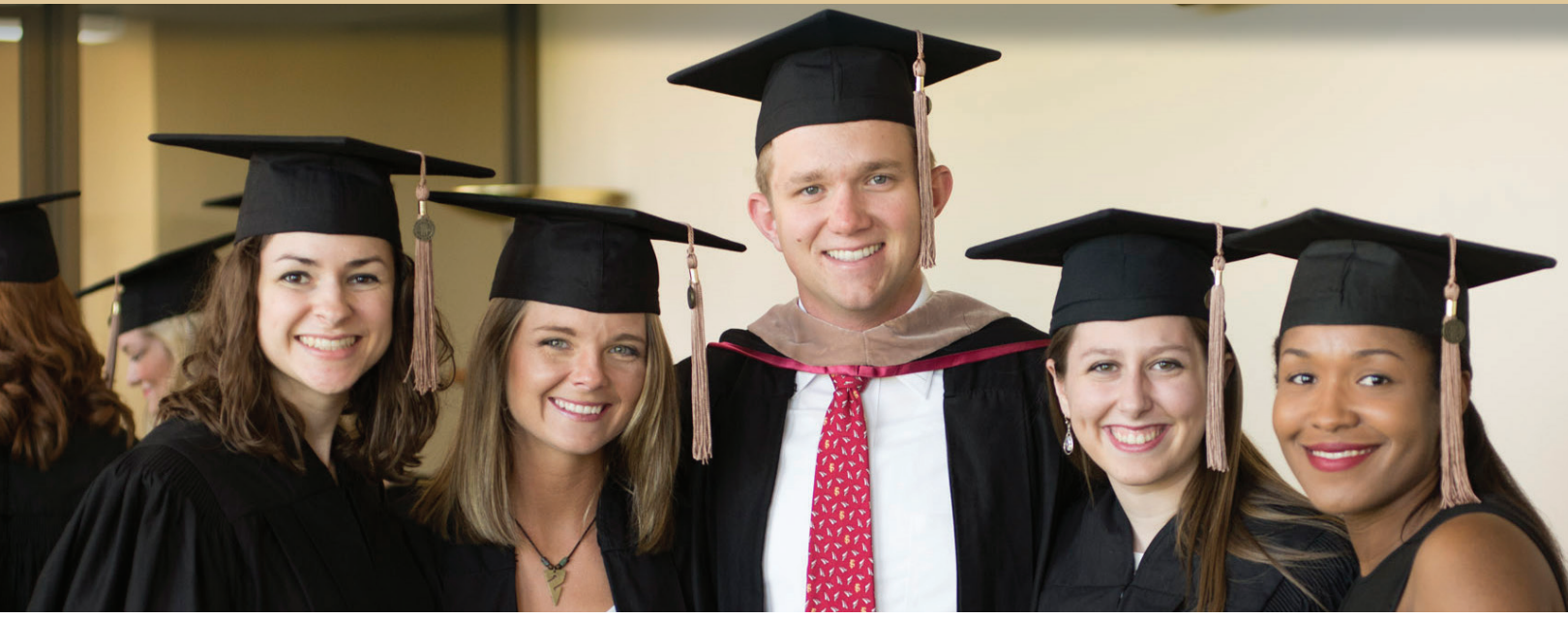
Students work with the same group of classmates from start to finish, developing lifelong relationships through team projects.

Our one-year, on-campus format is designed for students who are disciplined, organized and receptive to fast-paced challenges. You will hone your professional skills and collaborate with extraordinary peers in an environment that fosters creativity, teamwork and rewards problem-solving. You'll have access to our world-renowned faculty, who are experts in their fields of research.